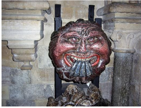
A medieval roof boss in Southwark Cathedral depicting the Devil swallowing Judas.