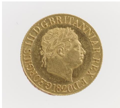
A George III Sovereign (Metropolitan Museum of Art)