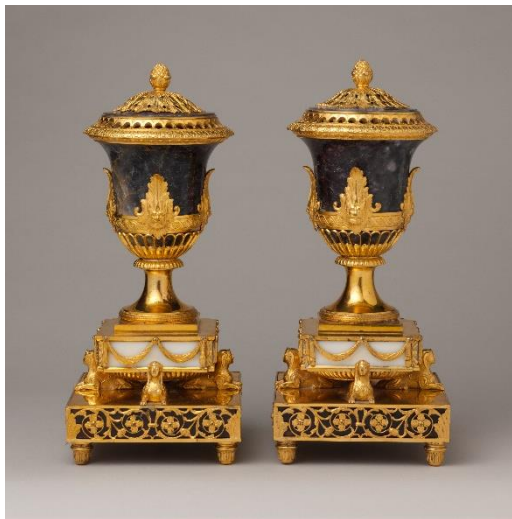
A pair of perfume burners by Matthew Boulton (Metropolitan Museum of Art)

Matthew Boulton made his money in what was known as the “toy trade”, which included the manufacture of goods in silver and gold such as snuff boxes and inkstands, and steel goods such as buckles, cork screws and candle snuffers. At his Soho works Boulton produced buttons, silver plate and ormolu. Many of these goods were exported to France.