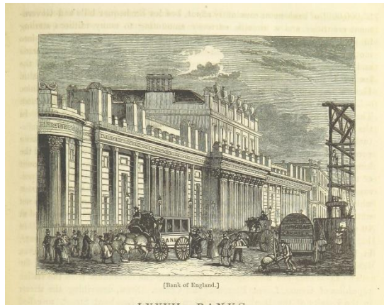
The Bank of England

In The Fatal Coin Dan, working undercover, invents a background story for himself, claiming he had worked at Boulton's Soho works. He also bases his scheme to catch the villain on Boulton's involvement with overmarking foreign coin by offering the highwaymen information about a fictitious consignment of overmarked Portuguese coin. Portuguese gold coins known as "Joes" were actually in circulation in Britain.