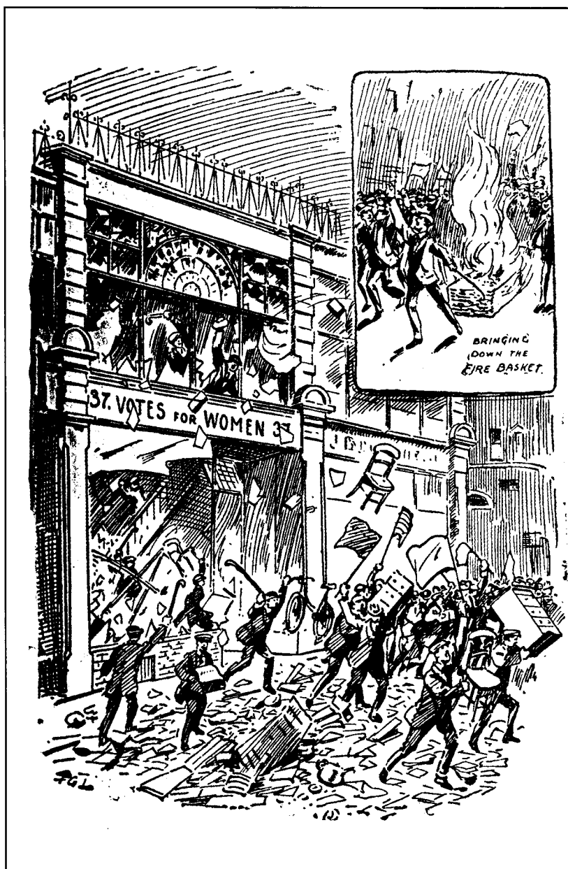
A cartoon in Nonesuch, December 1913, celebrating the students' attack

the few contemporary institutions with a commitment to equal opportunities.