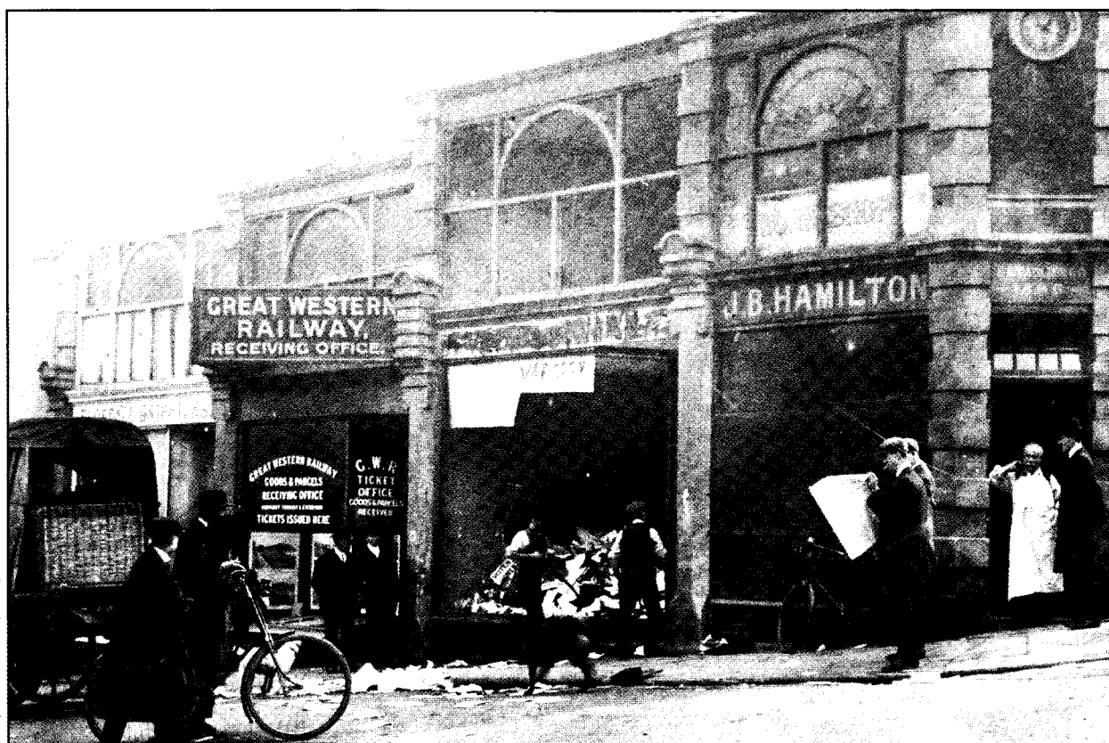
University of Bristol students' revenge on the suffragettes' headquarters