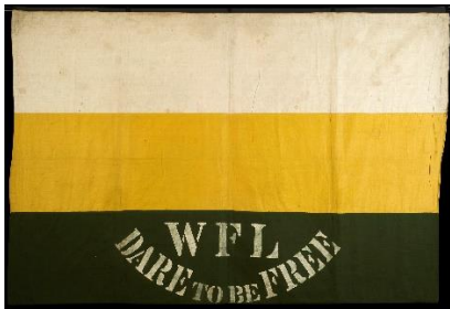
Women's Freedom League banner

In the following year, the WFL organized a picket of the House of Commons that lasted from July to November 1909. A number of women were arrested for obstruction and sentenced to seven days in prison.